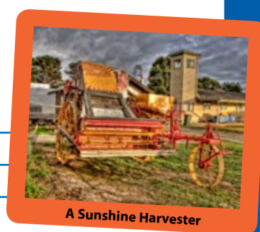
A Sunshine Harvester